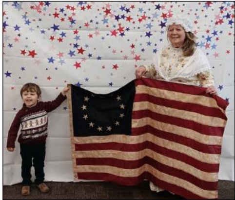
A young patron thanks "Besty Ross" for making the U.S. flag

met and had their pictures taken with George Washington, Benjamin Franklin, Betsy Ross, and other historical representatives. One young patron (pictured) told Betsy Ross, "Thank you for making my flag!"