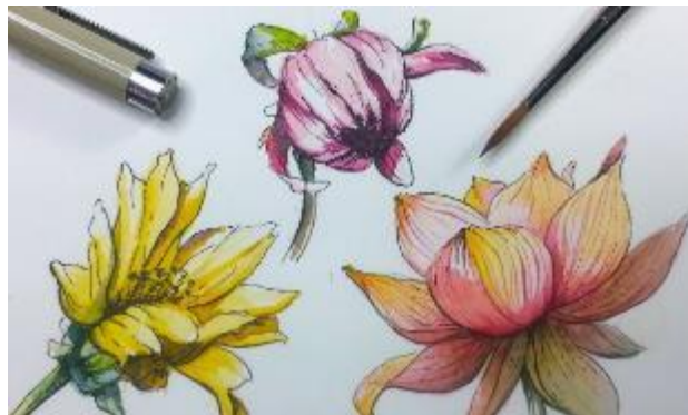
Pen & Ink Florals Mt Laurel | Adults March 21 - 10 am