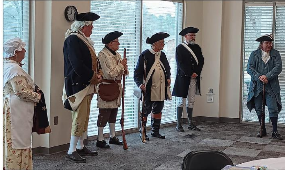
The Oak Mountain Chapter of the Daughters of the American Revolution and the Cahaba Coosa Chapter of the Sons of the American Revolution lead a program at the North Shelby Library celebrating the Boston Tea Party

Patrons enjoyed drinks and treats, a patriotic craft for children, and an enlightening presentation by several members of the Sons and Daughters of the American Revolution. Patrons